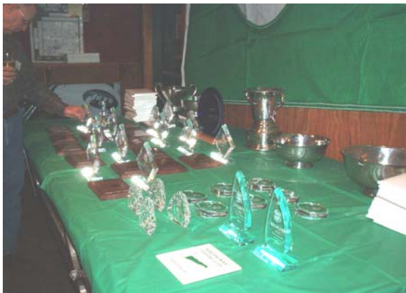
Racing Awards