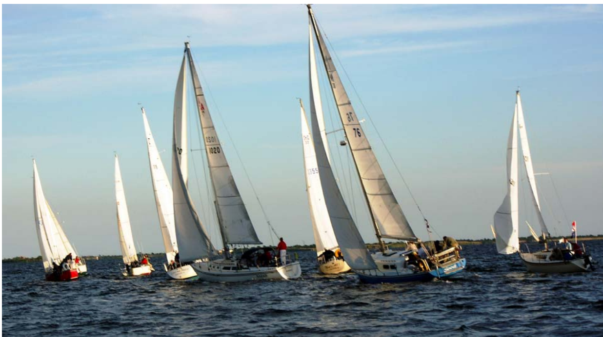
Twenty boats participated in Creepstakes 2005