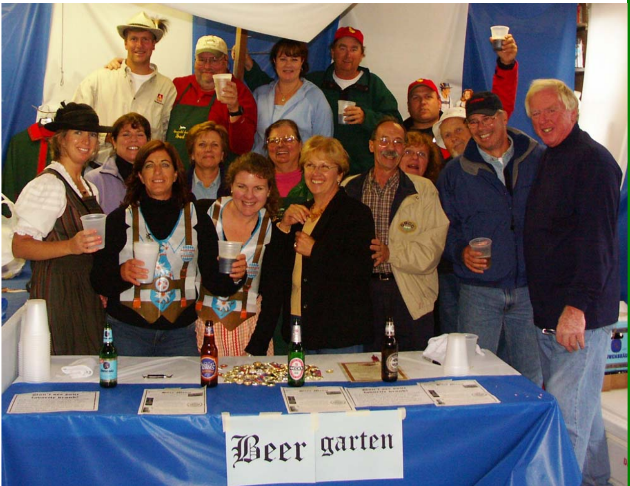
YOUR HOSTS FOR THE BOAT YARD OKTOBERFEST