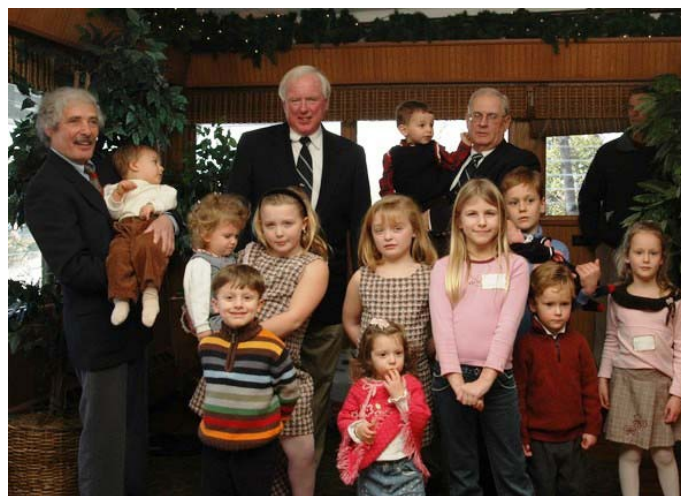
Future members of the SBCC include the grandchildren of the Commodore, Vice Commodore and Past Commodore as well as the children of the Rear Commodore and the Recording Secretary.