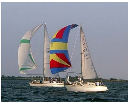
Mike Einsetler's Courageous and Greg Schneller's Mirage in the Babylon Cup