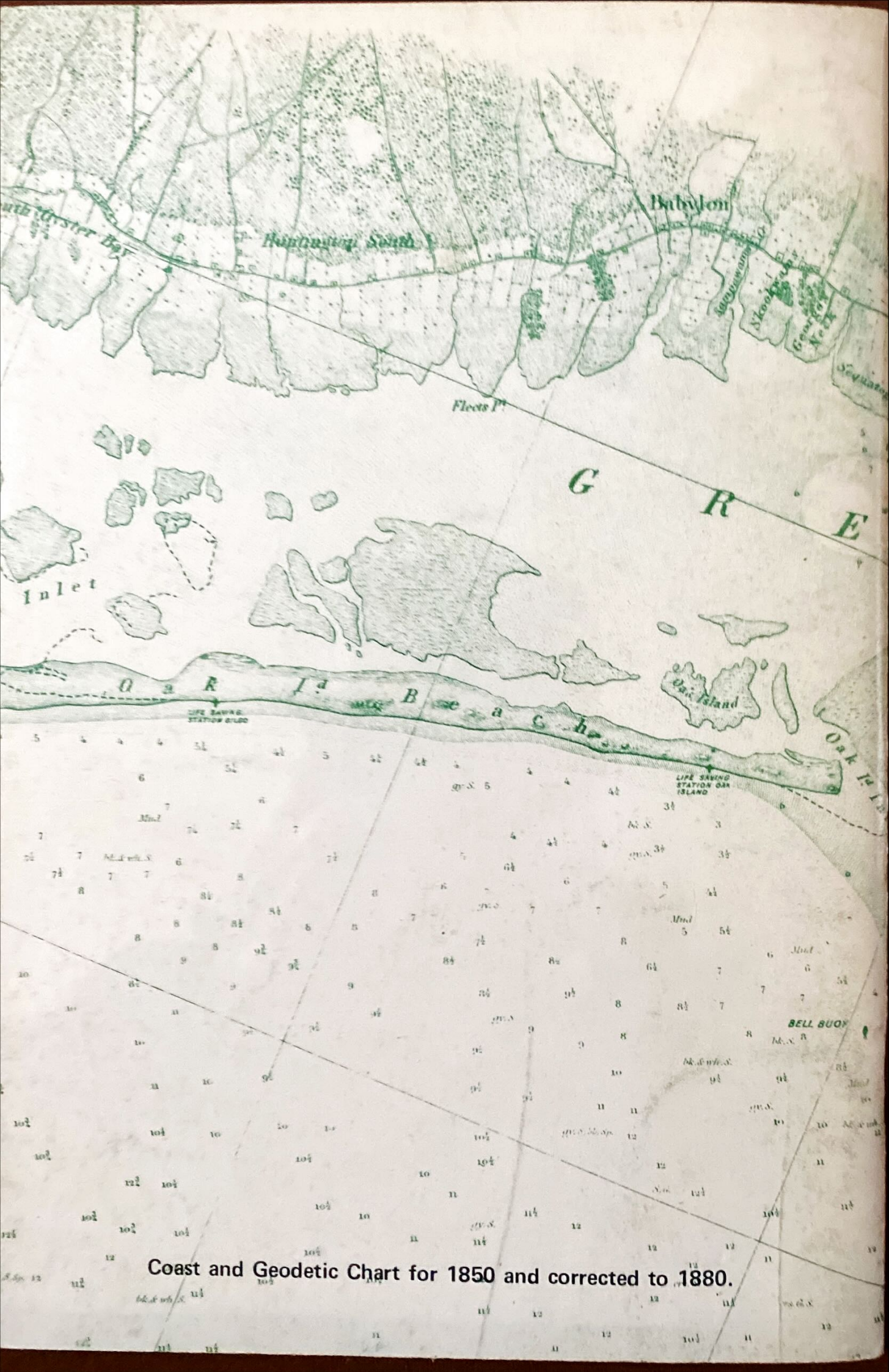
Coast and Geodetic Chart for 1850 and corrected to 1880.