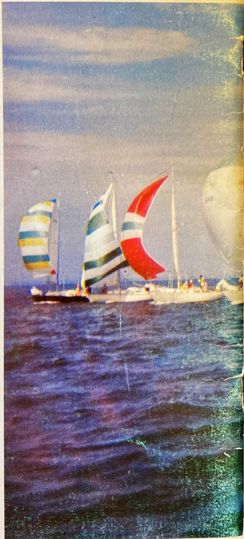
Start of West Island Race in 1971.